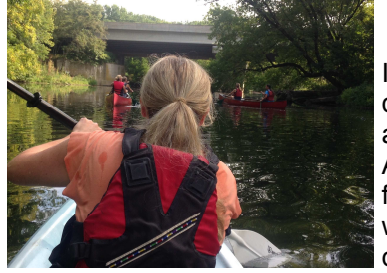
CPS Staff on the River

In the first full year of our strategic plan implementation, we are happy to report many wonderful activities as we strive to fulfill our mission. We started the year with an environmental