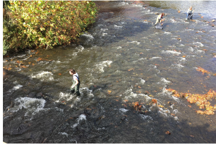
Collecting the Great Pumpkin Race of 2016

were provided with a guided tour of the Whitney Museum and focused upon creative artistic use of materials. Helping to support these immersive experienc-