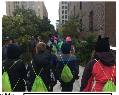
Walking the High Line In NYC