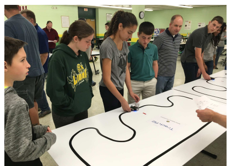
Completing the Course!