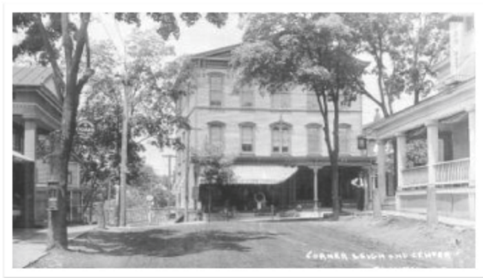
Leigh Street & Center Street (facing north) Early 1900s

This photo shows Leigh Street with the Grandin Library to the left and the Union Hotel on the right. Straight ahead on Center Street is a three story building with an awning, and a one lane truss bridge that connected Leigh Street with Halstead street across the South Branch of the Raritan River.